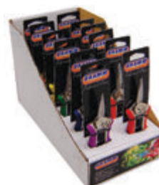
10-28020 compact shear