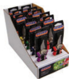
10-28010 compact pruner