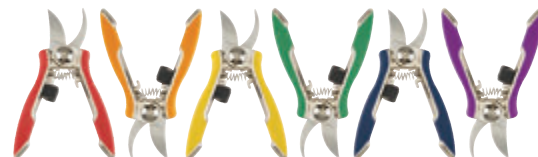
available in 6 colors